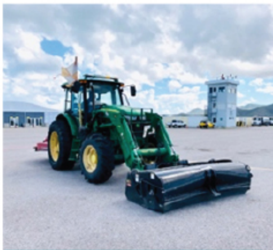
The Green FMD tractor with the sweeper broom attachment and a industrial broom used as the replacement sweeper while the sweeper truck is being repaired

The Facility Maintenance Department (FMD) was given the directive to continue clearing the area, including manually. The equipment used was the FMD tractor with the sweeper broom connection and an industrial hand broom. Articles gathered include napkins, plastic containers, vegetation, airline i.d. tags and sand.