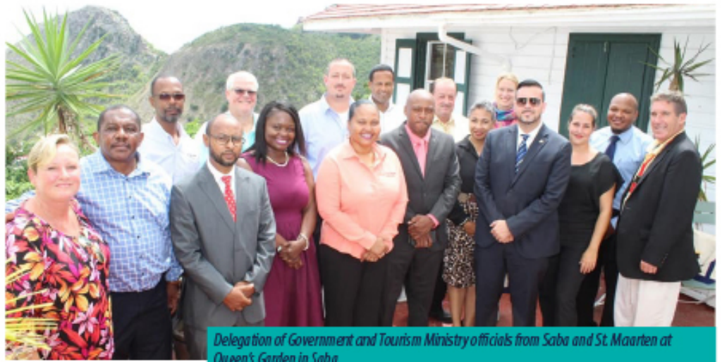
Delegation of Government and Tourism Ministry officials from Saba and St. Maarten at Queen's Garden in Saba

As a means of supporting Saba's connectivity to the rest of the world, both governments will also review and address the challenges and legislation