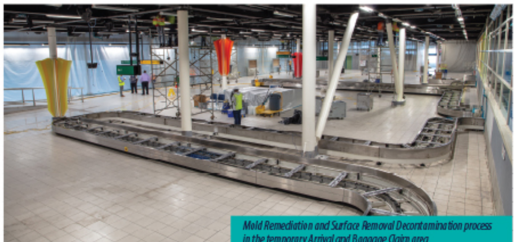
Mold Remediation and Surface Removal Decontamination process in the temporary Arrival and Baggage Claim area