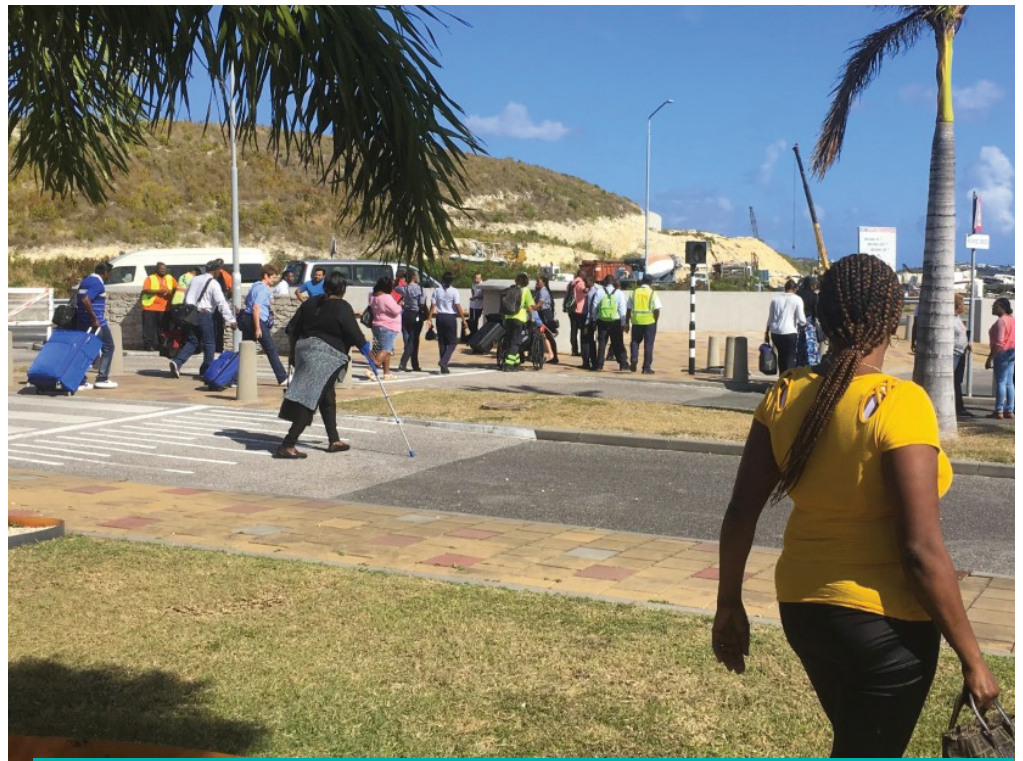
The airport community and passengers vacating the SXM Airport, following the general evacuation announcement.