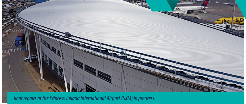
Roof repairs at the Princess Juliana International Airport (SXM) in progress.

The Riverclack roof panel is specially made for the SXM airport. The standard width of the Riverclack panel is 0.55 m, but due to the required strengthening of the roof, the width has been reduced to 0.39m.