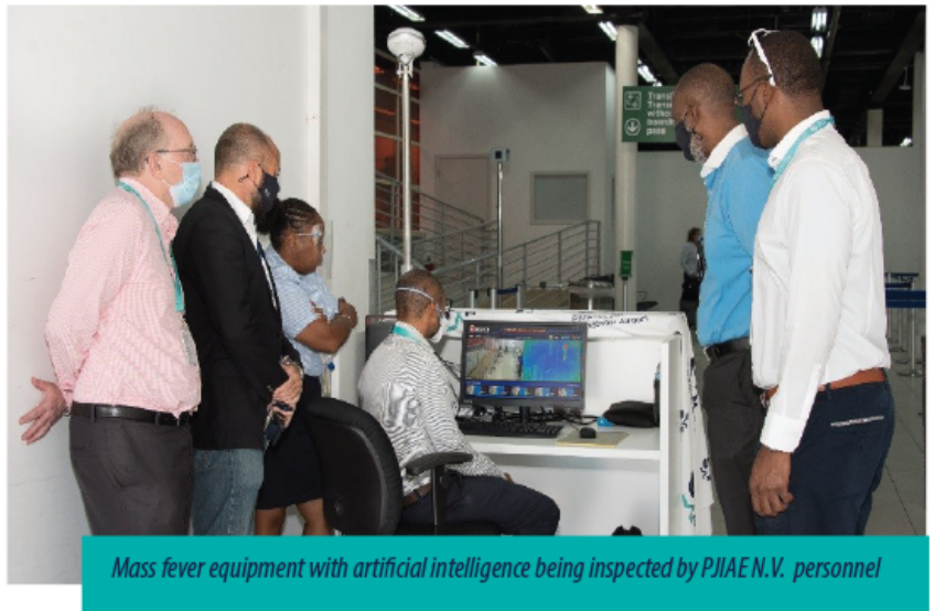
Mass fever equipment with artificial intelligence being inspected by PJIAE N.V. personnel

According to the Collective Prevention Services (CPS) the COVID-19 screening guidelines suggest that persons with temperatures of 38 degrees or higher should be flagged because they could possibly be showing symptoms of the virus. Studies also established that the mass fever screening equipment can detect temperatures up to eight (8) meters away and is safe for the frontline staff of the Airport. These non-contact devices can quickly measure and display a