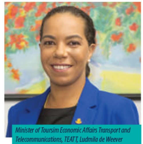
Minister of Tourism Economic Affairs Transport and Telecommunications, TEATT, Ludmila de Weever

only shows our resilience but re-emphasized the need to re-open to ensure all can put food on their table. While the decision to re-open was never an easy one, the Government remains committed to protecting our nation and boosting our economic recovery.