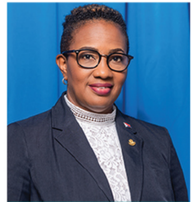
Silveria Jacobs, Prime Minister

The St. Maarten Medical Center has a capacity to handle four COVID-19 cases, and should there be more than that, the Government of St. Maarten has