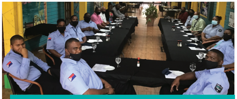
New Security Guards during the certification ceremony.

Amongst the vigorous training, the newly installed security guards engaged in training on the Standard Operations Procedures (SOP),