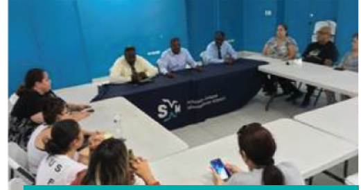
FILE PHOTO: Public outreach campaign meeting with the Simpson Bay Community Council