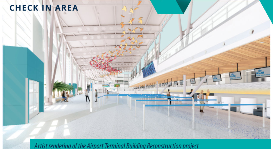
Artist rendering of the Airport Terminal Building Reconstruction project

the intent to offer information disclosure and attain feedback from stakeholders about the Airport Terminal Reconstruction Project. The Public Outreach Campaign is interrelated with the approved Stakeholder's Engagement Plan (SEP), to maximize and manage the awareness of the project.