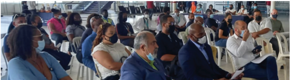
Staff and stakeholders at the “Educate to Vaccinate” event