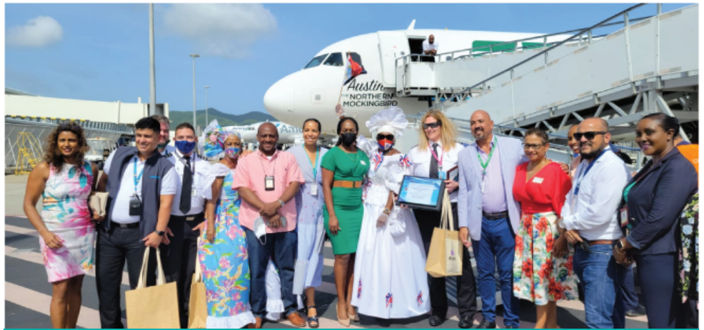
Frontier Airlines Inaugural at the Princess Juliana International Airport (SXM)