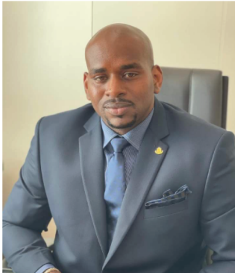
Honorable Minister of Public Health, Social Development and Labor, Omar Ottley

comprehend the facts about the vaccine to then make a more personal decision on their choice to vaccinate or not. The summer themed affair scored high attendance from an exclusive group of internal stakeholders and Airport staff at the former Check-In Hall at the vacant premises.