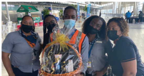
CENTER: JetBlue employee receives raffle prize courtesy Penha Perfume concession

The Quality and Safety department ensured that all the necessary prevention and mitigation measures were adhered to, in efforts to prevent any possible outbreaks