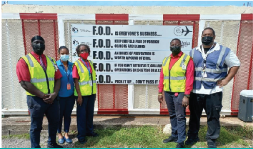
Members of the F.O.D. clean-up campaign team

Operations reported that the cargo apron needed a bit more focus since there was a large amount of FOD in the area. Upon completion of the campaign, the volunteers assembled for the official weighing of the objects removed throughout the Airport sighting.