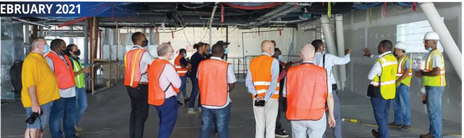
Members of the various local media companies and local blogger during a special tour of the terminal building