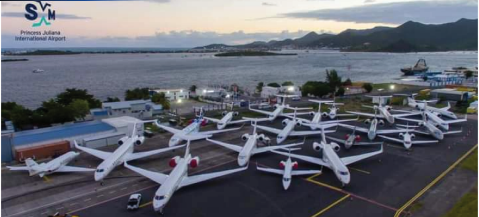
High demand for corporate jets at SXM Airport