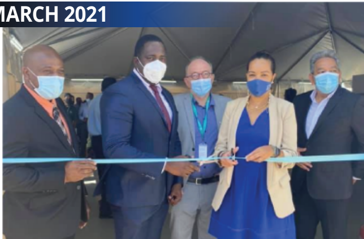
Covid-19 Testing Center at SXM Airport