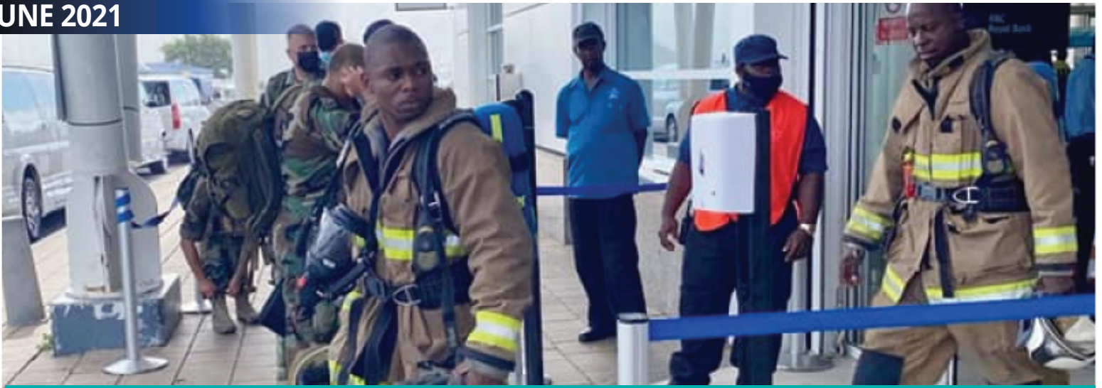
Rescue and Firefighting team exits the SXM Airport during the Terminal Building Evacuation Exercise.