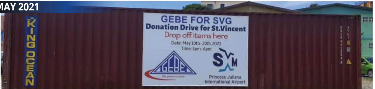
Shipping container used to send aid to St. Vincent and the Grenadines (SVG)

The R&FF long-established that the evacuation exercises are in accordance with the Fire Safety and Evacuation plan of the Airport. Although the general public was put on guard beforehand about the date of the exercise to curb any possible panic, the time of the drill was not disclosed, to lend to an effective evaluation of a response during an evacuation.