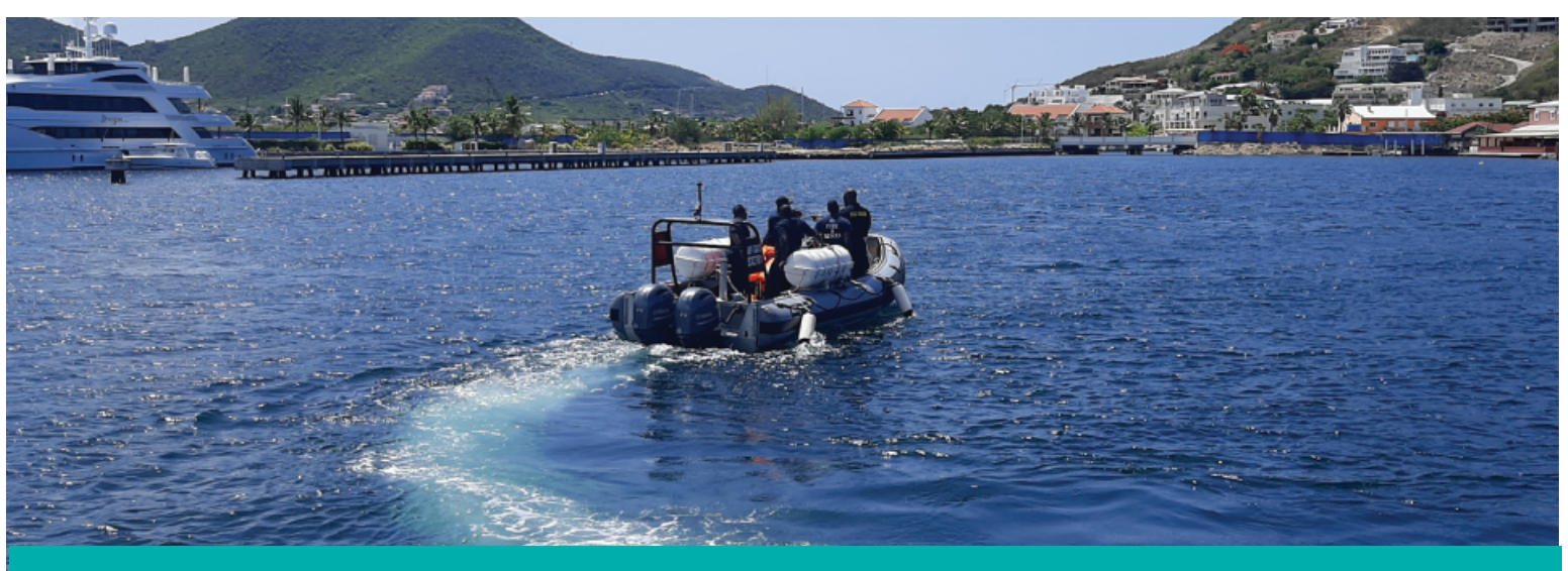
Sea rescue training with the PJIAE N.V. Rescue & Firefighters and St. Maarten Coast Guard in the Simpson Bay Lagoon, St. Maarten.