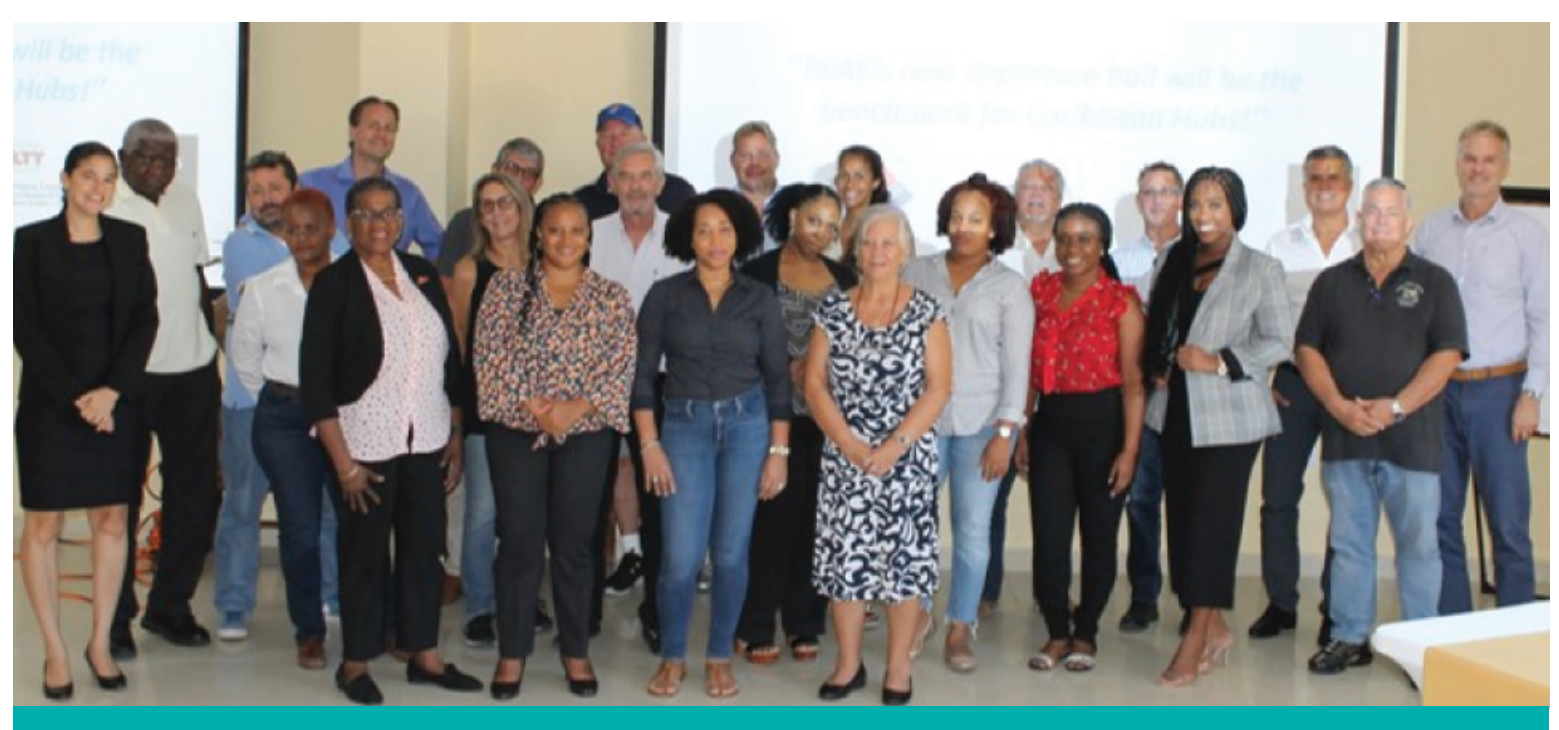
PJIAE N.V. team during the kick-off meeting with the retail and food and beverage partners and IXI-Design.