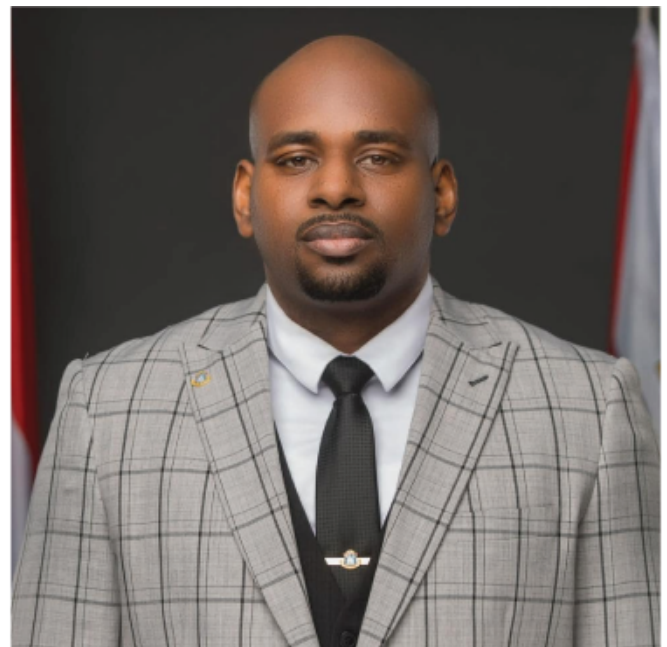
Hon. Minister of VSA, Omar Ottley

Sint Maarten is no exception, the intention is for EHAS to transition into our Port Health Authority, which is mandatory for all the countries within the kingdom. An international health regulation (IHR) meeting was held last month in Aruba and is scheduled to be a yearly event. The IHR requires each country to be able to detect, asses, report, respond and stop outbreaks of infectious diseases before they spread internationally.