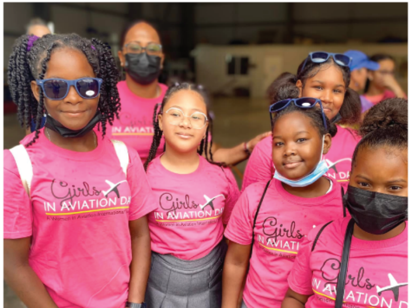
Students of the Dr. Martin Luther King Jr. School attending the first Girls In Aviation Day

As a part of the exhibition was hosted at the Airport’s HeliRiviera hangar, as an added treat, the students witnessed the arrival of a pair of U.S. Marine Corps MV-22 Ospreys loading troops on a training mission.