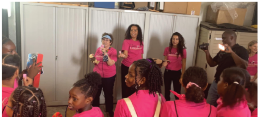
Some members of Women in Aviation International and students of the Dr. Martin Luther King Jr. school of St. Maarten