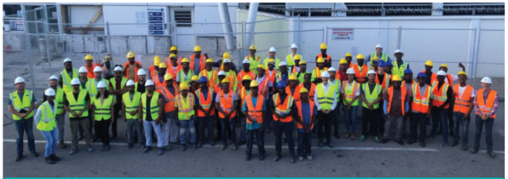
Group photo of the employees of Ballast Nedam International currently working on the reconstruction project at the Princess Juliana International Airport.

International Projects: "I would like to thank all the employees of BNIP, the Project Management of PJIAE and Engineers team for continuous support and dedication on safety. This can only be achieved because all of us take full responsibility on health and safety matters".